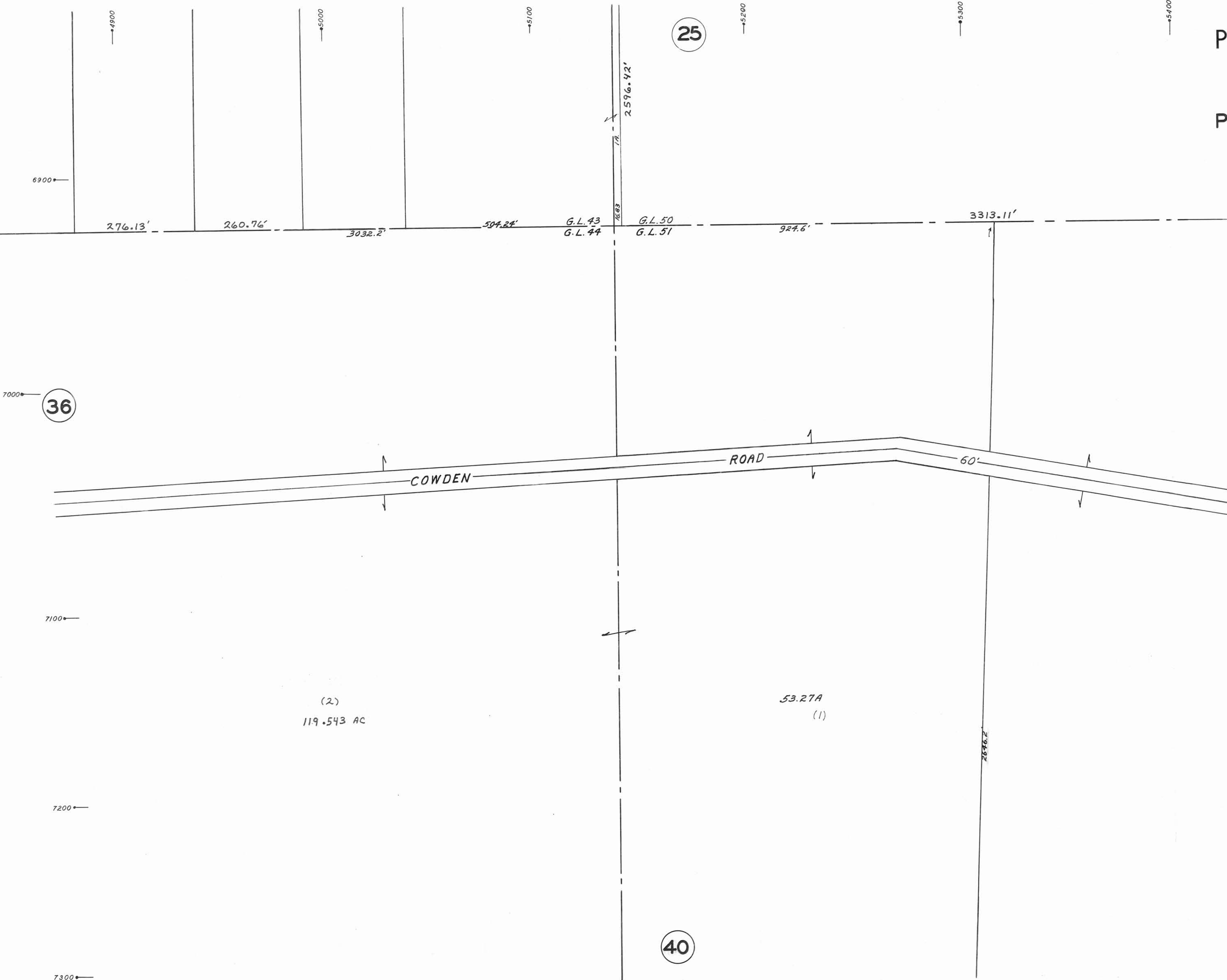
PLATE 39 43-50 G.L.No. 44-51 POLAND TWP.