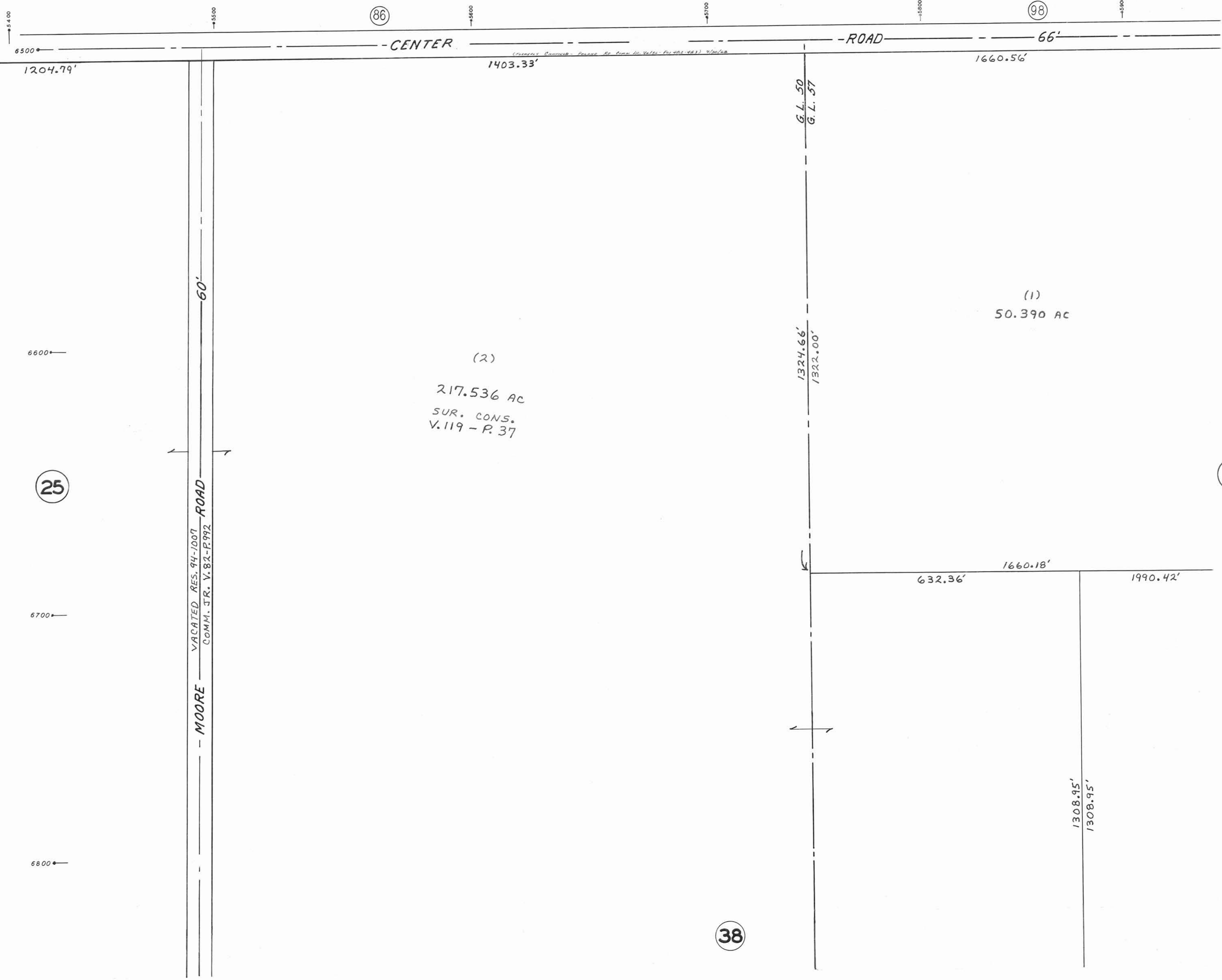
PLATE 26 G.L. No. 50-57 POLAND TWP.

OFFICE OF COUNTY ENGINEER MAHONING COUNTY COURT HOUSE YOUNGSTOWN, OHIO