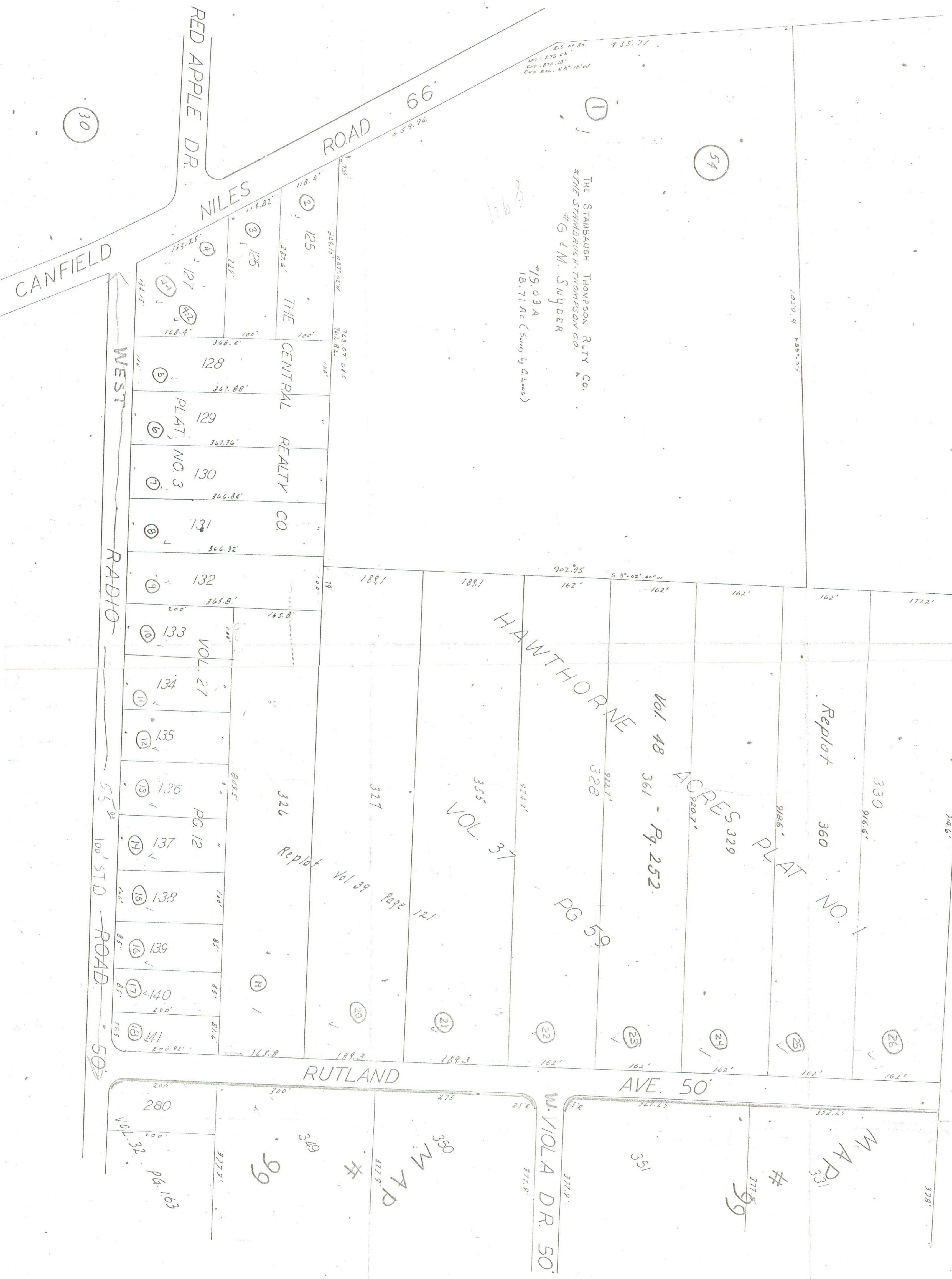
PLATE 98 SECTION No. _____ TRACT 687 AUSTINTOWN TWP. OFFICE OF COUNTY ENGINEER MAHONING COUNTY COURT HOUSE YOUNGSTOWN, OHIO