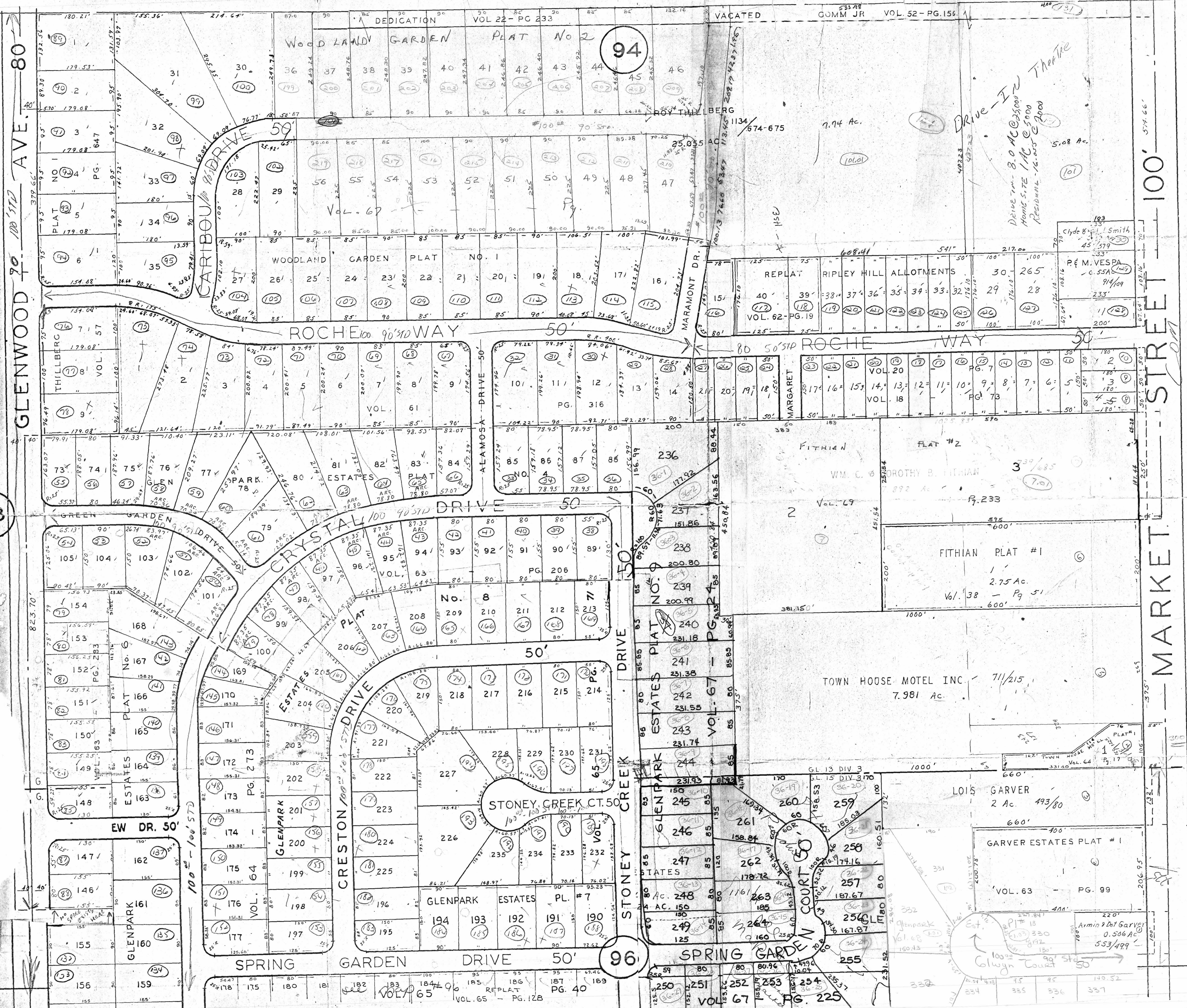
PLATE 95 G. L. 13, 15. DIV. 3. BOARDMAN TOWNSHIP

OFFICE OF COUNTY ENGINEER 940 BEARS DEN ROAD YOUNGSTOWN, OHIO