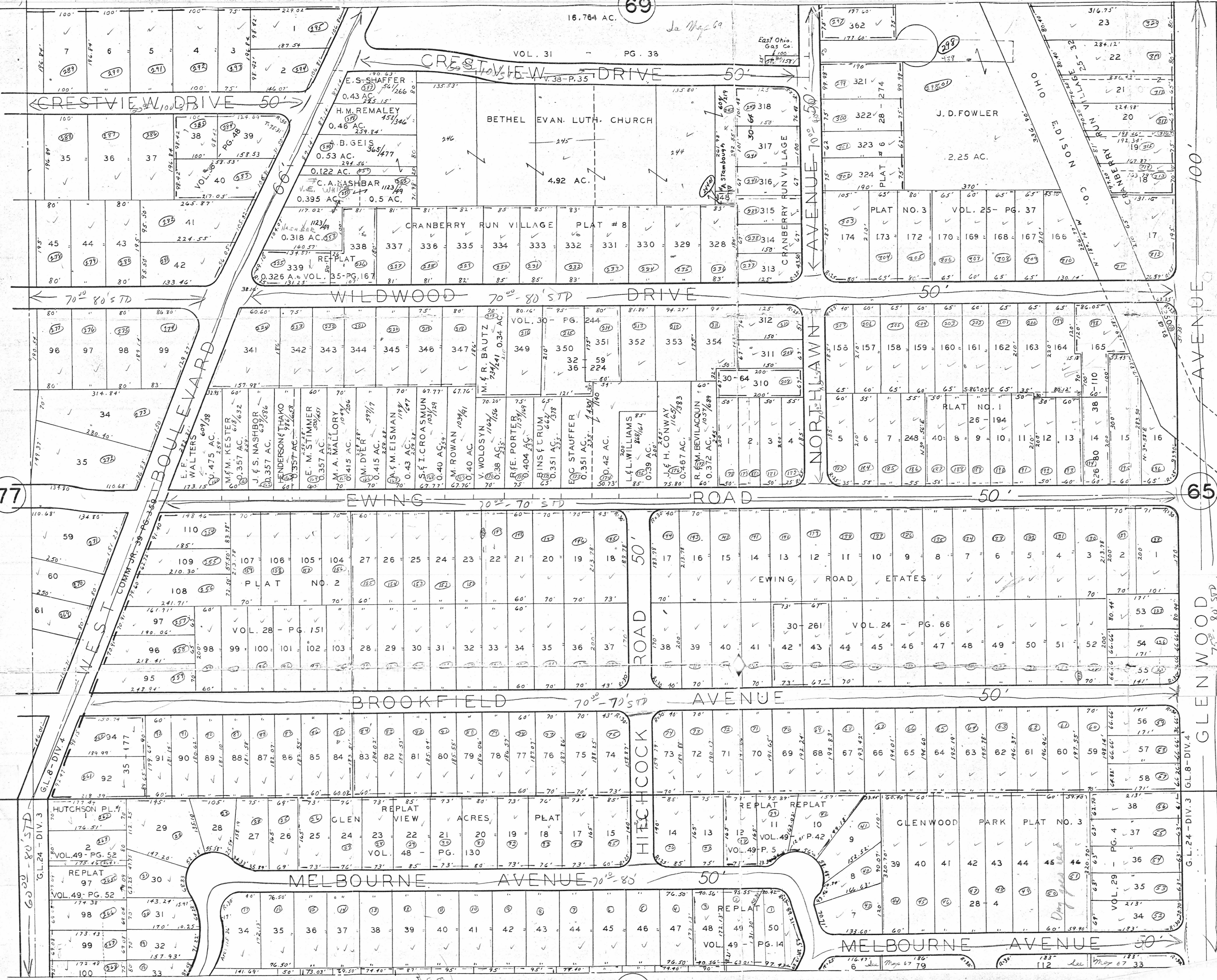
PLATE 68 G.L. 24 - DIV. 3 G.L. 8 - DIV. 4 BOARDMAN TOWNSHIP

OFFICE OF COUNTY ENGINEER 940 BEARS DEN ROAD YOUNGSTOWN, OHIO