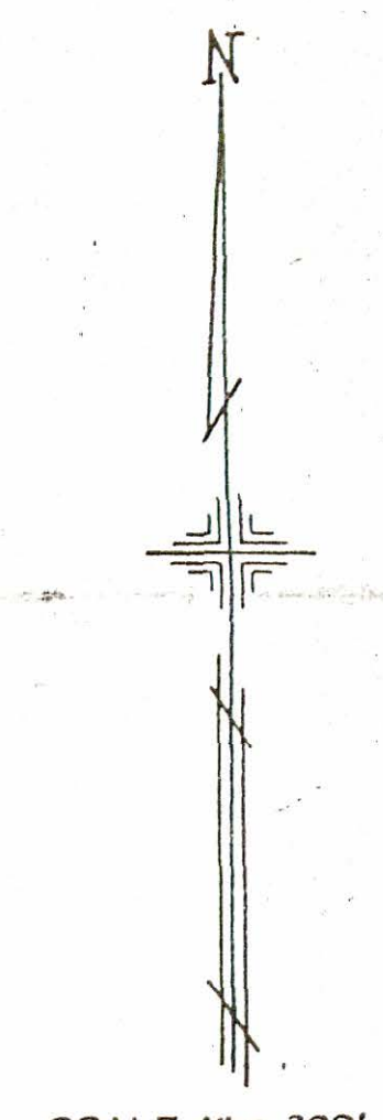
SCALE 1" = 200'