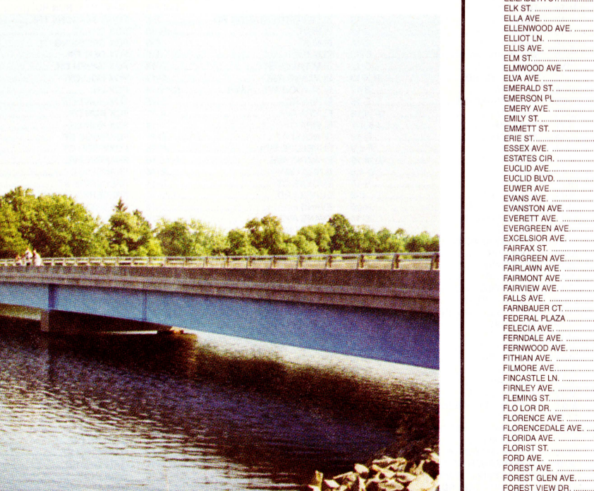
JACOBS ROAD BRIDGE