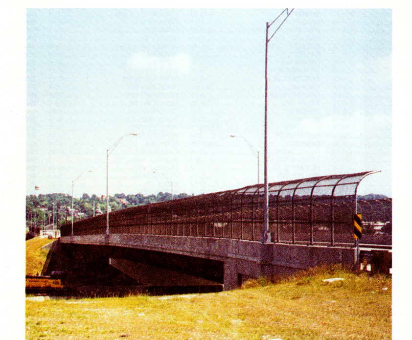
WORLD WAR II VETERAN'S MEMORIAL BRIDGE