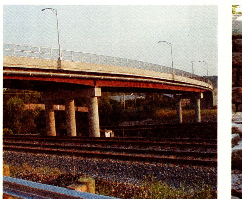
KOREAN VETERANS MEMORIAL BRIDGE CITY OF STRUTHERS