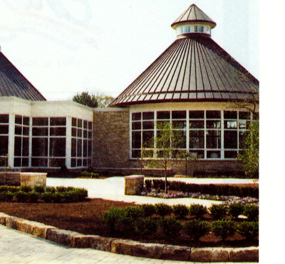
D.D. & Velma Davis Educational & Visitor Center