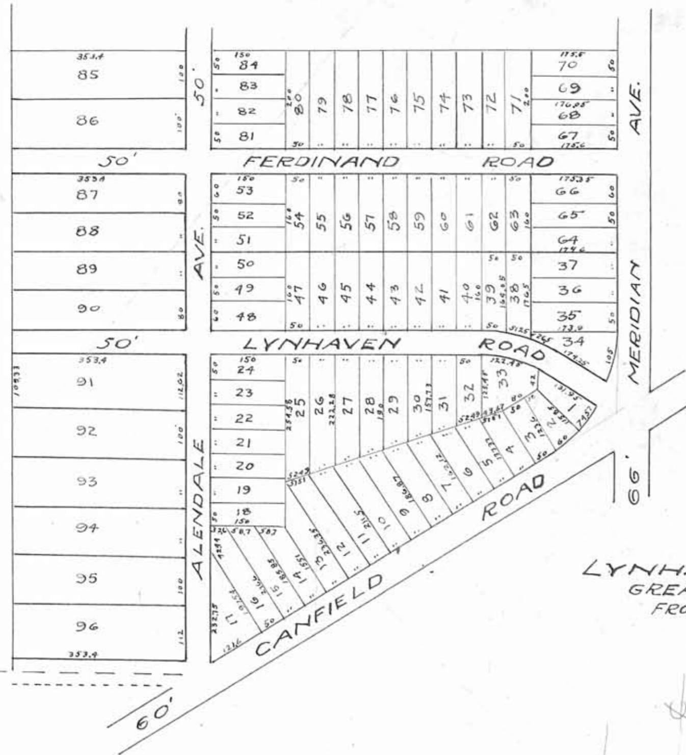
LYNHAVEN PLAT GREAT LOT NO.17 FROM PAGE 9